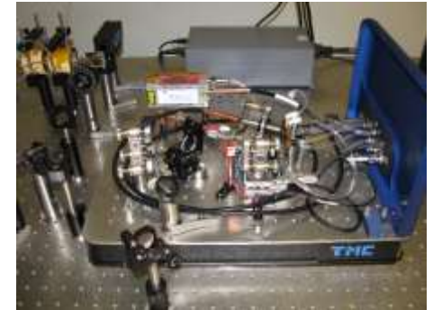
Optically-Pumped Semiconductor Laser